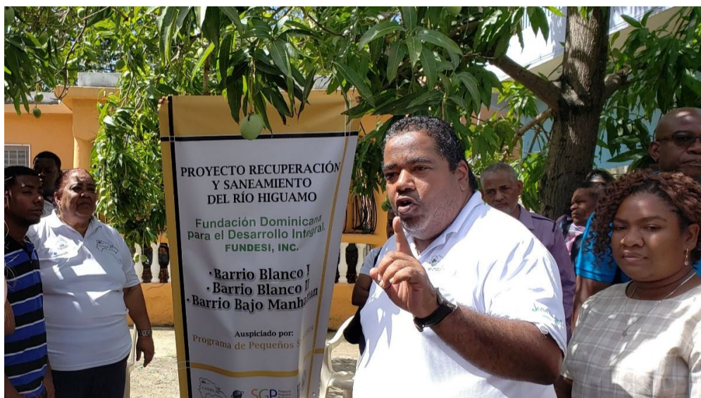
Community members participating in the GEF SGP Project related to the IWECO Project in San Pedro de Macoris, Dominican Republic, April 2019.