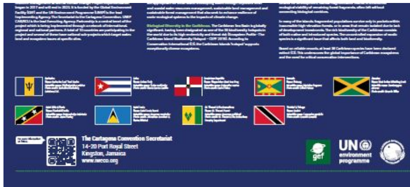
Introductory poster - "Snapshots of Biodiversity in IWEco" poster series